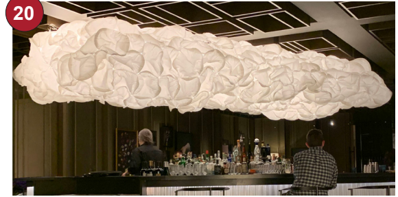
20 Cloud Bar 625 First Street (Hotel AKA Alexandria) Artist: Frank Gehry, 2023