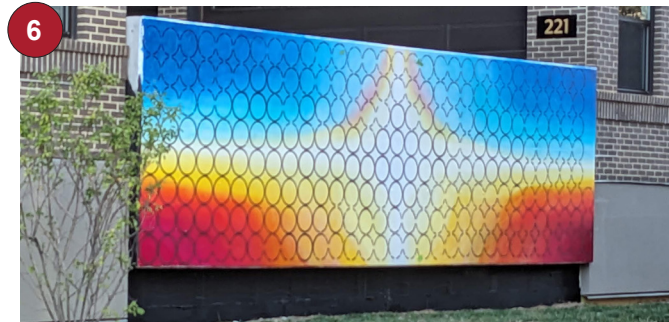
6 Good Morning Star Shine Wall of Venue condominium at Mount Vernon Trail Artist: Patrick Kerwin, 2023