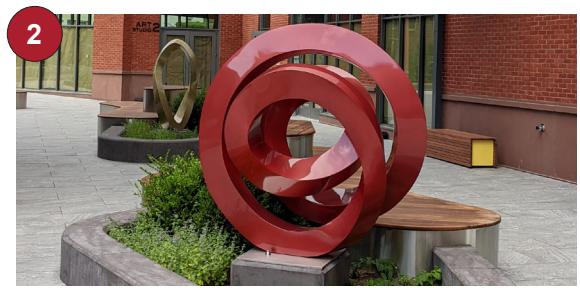
2 Muse Sculptures 1201 North Royal (Muse condominiums) Artist: Jeff Chyatte, 2022