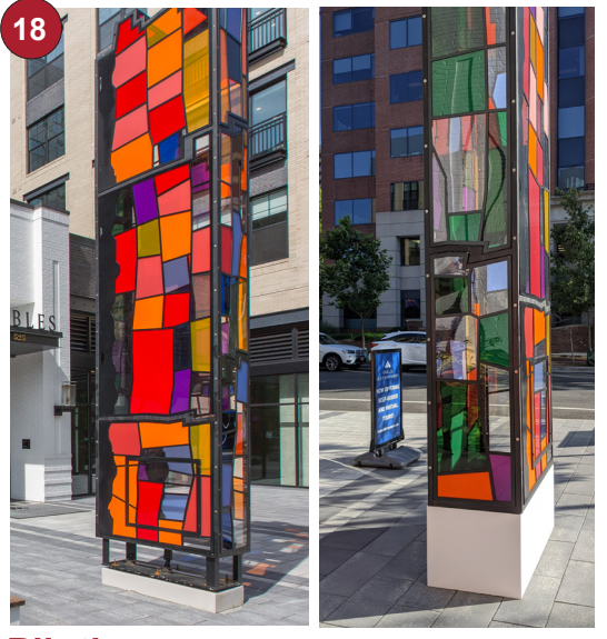
18 Plinth 525 Montgomery Street (Gables Old Town North) Artist: Tom Fruin, 2019